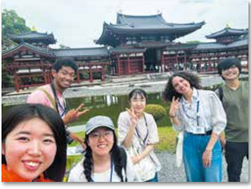
Uji-city Walking 宇治散策

国際交流ラウンジ International Lounge 国际交流吧 국제교류라운지