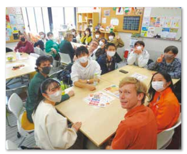
Lunch Talk ランチトーク