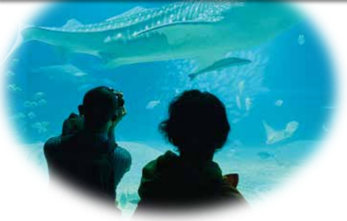
Osaka Aguarium Kaiyukan 海遊館